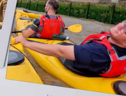
High Achievers July 2023