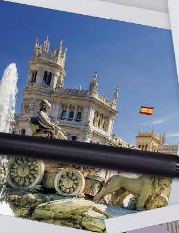
Madrid June 2016