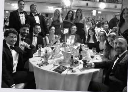
Recruter Awards September 2021