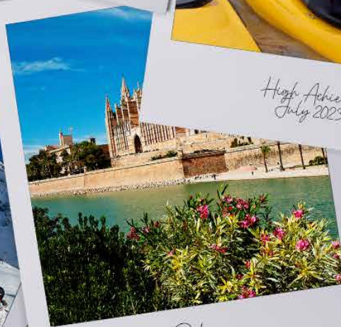
Palma June 2019