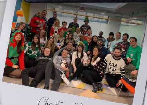
Christmas Party December 2022