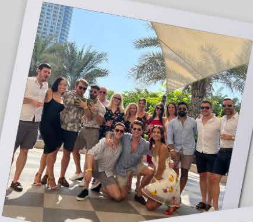
Dubai October 2021