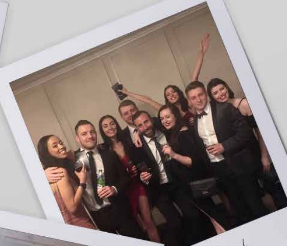
Recruitment Awards September 2021