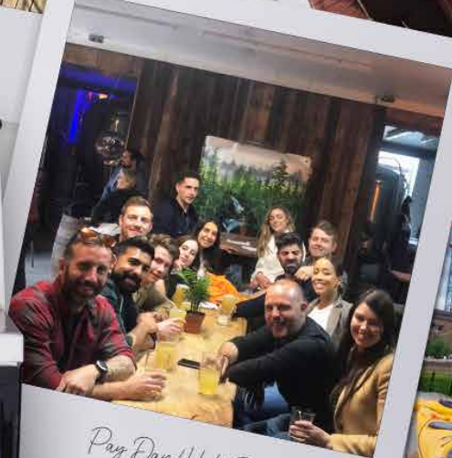
Pay Day / Half Day May 2021