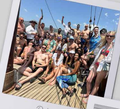
Dubrovnik June 2023